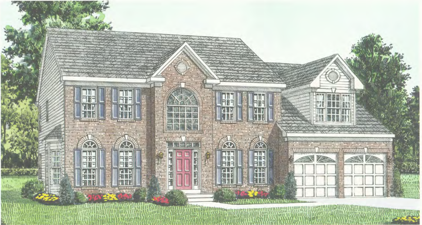
FRONT ELEVATION 1 w/standard Brick front & optional bay and sunray windows