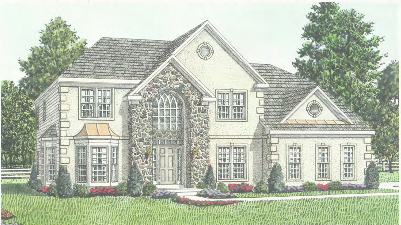
FRONT ELEVATION 2 w/optional Stone & Stucco front & optional side load garage & optional bay windows